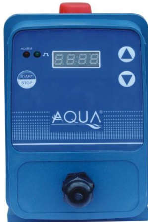
安装配件 Installation accessories